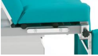
AV4088 -LATERAL UNIVERSAL PROFILES FOR ACCESSORIES LINK