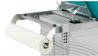
AV4097V -PAPER SHEET SUPPORT