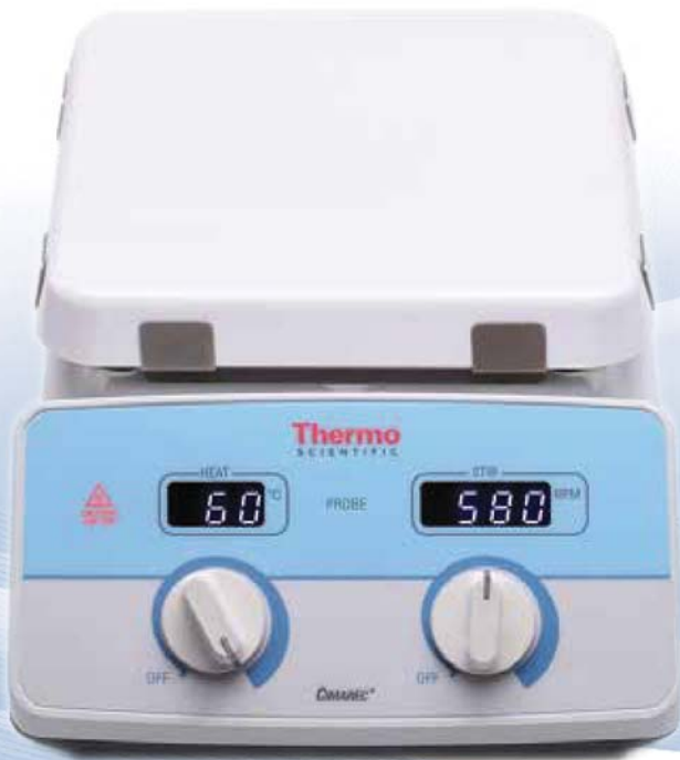
Cimarec+ Digital Stirring Hotplate

The Cimarec+ units are available in three sizes, providing flexibility from microscale chemistries to production operations.