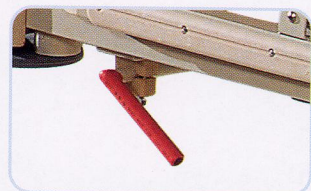
床兩側配置快速復位拉手，方便操作，符合快速急救要求。 CPR handle on both side of the bed , easy to operate, available for emergency.