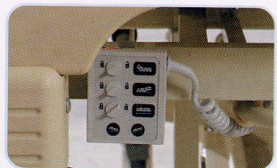
小護士操作器置于床尾，有效控制手控器的使用，避免誤操作。 Control box at the end of the bed, to control the handset, enable safe operation