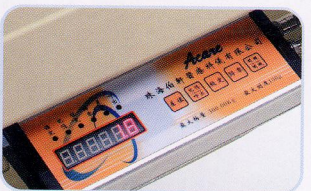
多功能磅秤顯示器，操作簡易。 Multi-function indicator, easy to operate