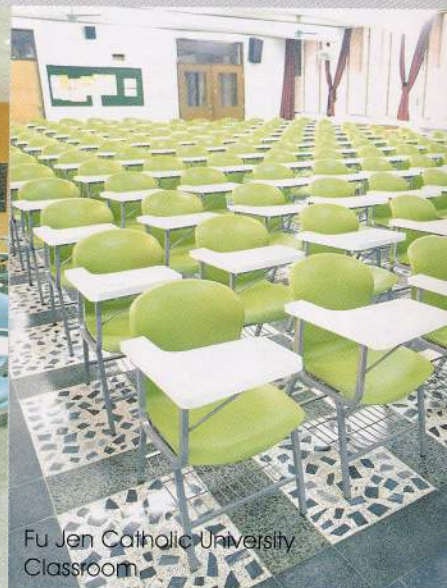
Fu Jen Catholic University Classroom