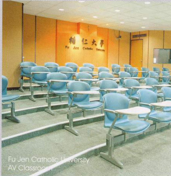
Fu Jen Catholic University AV Classroom

The tablet arm neatly equips (RA-318) for student use. The design of easy assembly enables space saving during transportation and flexibility for chair with or without tablet arm.