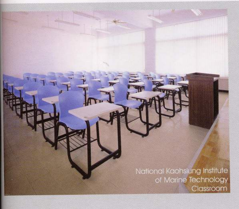
National Kaohsiung Institute of Marine Technology Classroom

We cherish every line and the visual esthetics of this product. It promotes study quaility effectively.