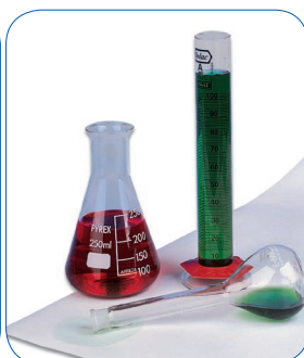
Benchkote™ protection paper