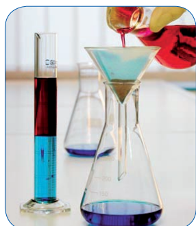
1PS phase separator

In addition to the filtration consumable range, we provide a comprehensive range of accessories for routine work in your laboratory. The table below shows a selection of the products we offer.