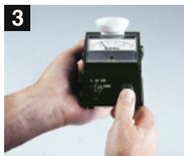
Push button to indicate reading