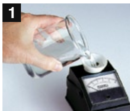
Rinse and fill cell cup