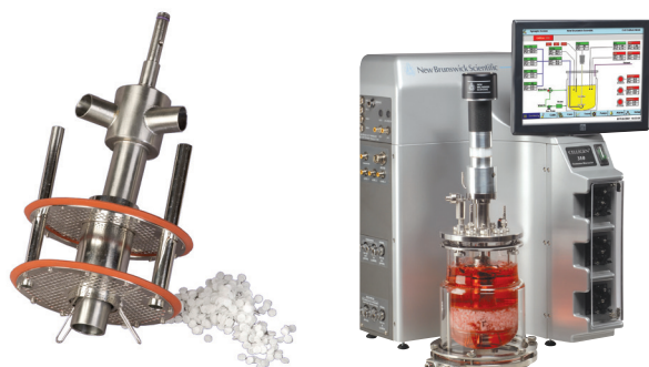
Figure 1. Left: The packed-bed basket impeller including Fibra-Cel disks. Right: The CelliGen 310 bioreactor with 2.5 L vessel.