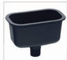
PP Sink resistant to acid, alkali and anti-corrosion