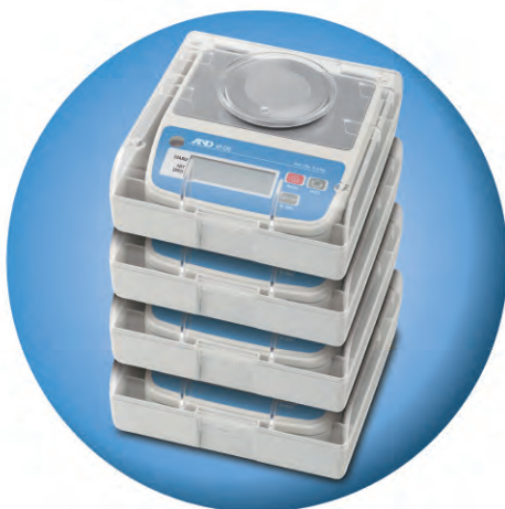
Stackable Carrying Case (Standard)