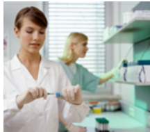
Clinics / University Hospitals