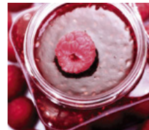
Food / Beverage