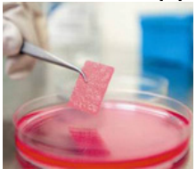
Bio Tissue Engineering