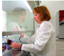
Basic Research / Research Institutes