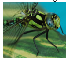
Plant / Insect Growth