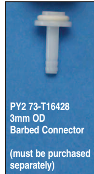
PY2 73-T16428 3mm OD Barbed Connector (must be purchased separately)