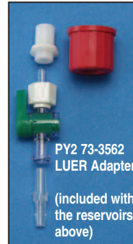
PY2 73-3562 LUER Adapter (included with the reservoirs above)