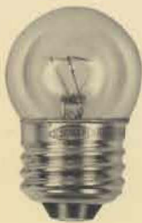
30W. for High Voltage