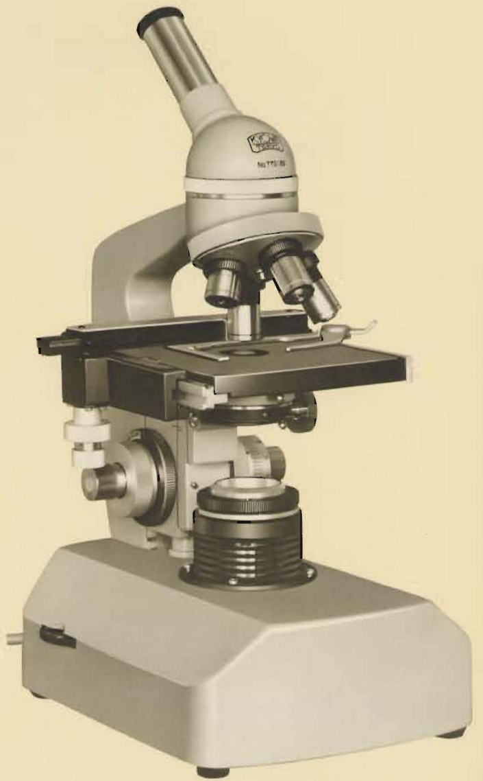
Low Voltage Lamp 6V18W