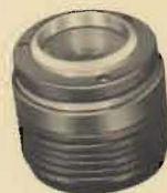
Lamp house with blue filter, aspheric lens for HVV30W and plus heat absorbing filter for LVV18W.