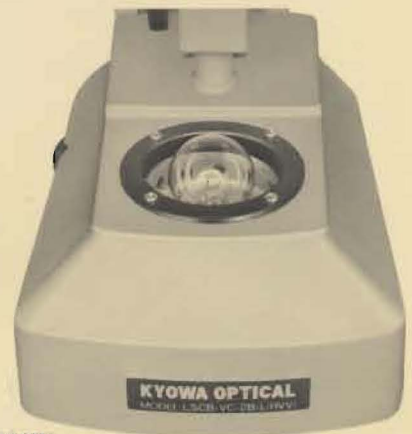
Showing Lamp base