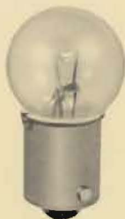
6V. 18W. for Low Voltage