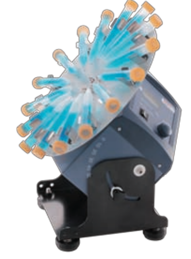
MX-RD-Pro With dish accessory