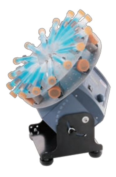
MX-RD-Pro With dual dish accessories and support rods