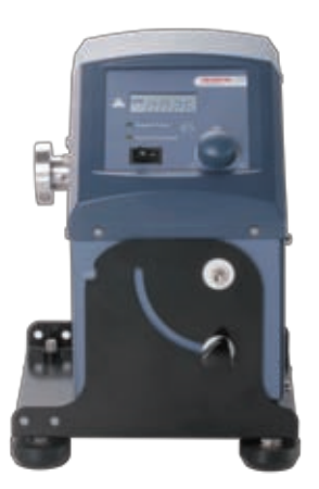
MX-RD-Pro LCD Digital Rotator

Our rotators give gentle but effective mixing of biological samples to be held in 1.5mL to 50mL micro tubes, used in a variety of applications including immune precipitations, prevention of blood coagulation, latex diagnostics etc.