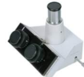
Trinocular Viewing Head