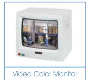
Video Color Monitor