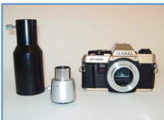
Photography set with reflex camera & adapter