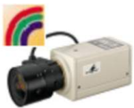
Video viewset with Video camera and adapters