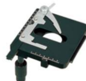
Double layered Stage