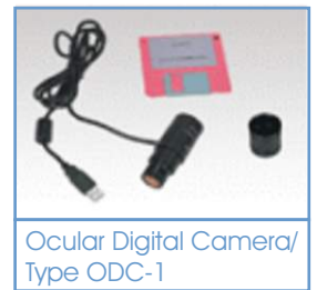
Ocular Digital Camera/ Type ODC-1