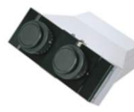
Binocular Viewing head