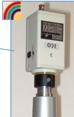
CCD Video Camera