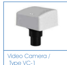
Video Camera / Type VC-1