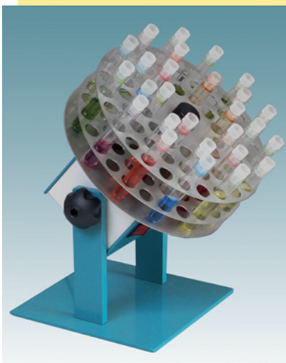
Accessory for tubes Cat.No.: 28085