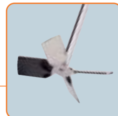
Propeller stirrer R 1342