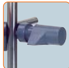
Boss head clamp R 182

(OST 20 basic, R 182, R 1826, R 1342) Package Id-Nr. 9008700