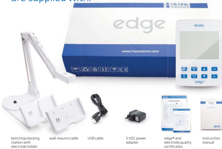
benchtop docking station with electrode holder wall-mount cradle USB cable 5VDC power adapter edge® and electrode quality certificates instruction manual

All edge® single parameter meters are supplied with: