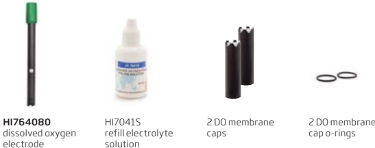
HI764080 dissolved oxygen electrode HI70415 refill electrolyte solution 2 DO membrane caps 2 DO membrane cap o-rings

edge®DO: HI2004-01 (115V) and HI2004-02 (230V) also includes: