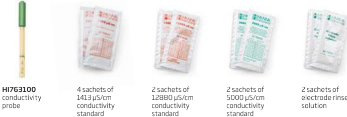
HI76310 conductivity probe 4 sachets of 1413 µS/cm conductivity standard 2 sachets of 12880 µS/cm conductivity standard 2 sachets of 5000 µS/cm conductivity standard 2 sachets of electrode rinse solution

edge®EC: HI2003-01 (115V) and HI2003-02 (230V) also includes: