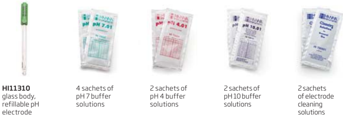
HI11310 glass body, refillable pH electrode 4 sachets of pH 7 buffer solutions 2 sachets of pH 4 buffer solutions 2 sachets of pH 10 buffer solutions 2 sachets of electrode cleaning solutions

edge®pH: HI2002-01 (115V) and HI2002-02 (230V) also includes: