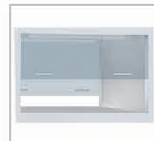
Double Sides Double sides work bench, operators can sit face to face