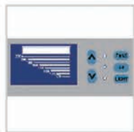
LED Display Microprocessor control system, LED display