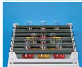
Order No. 3967

Non-slip mat for the shaking platform, 420 x 420 mm size, for slow moving, e.g. nutrient solutions in Petri dishes