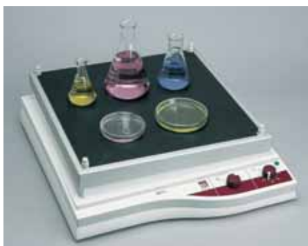
3011 Analogue Orbital Rocking Motion Shaker with Non-slip Mat 3965