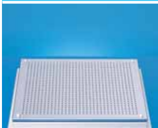
Order No. 3966

Shaking tray made of stainless steel, 450 x 450 mm, with holes to accommodate clamps for Erlenmeyer flasks and other accessory equipment