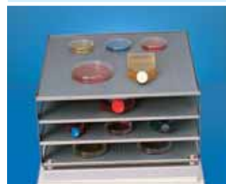
Order No. 3968

Universal mount for secure attachment of different shaking objects between the six rubber-coated bars