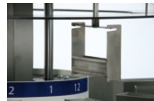
Transport basket for slides