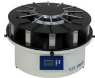
MSM during staining