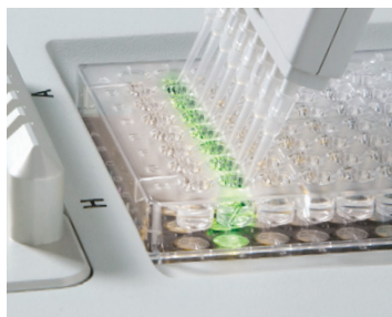
Sample Position Illuminator